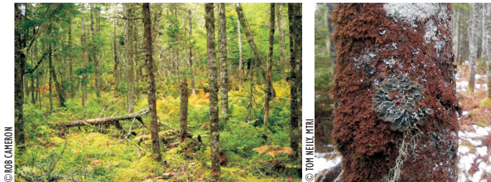
Vole Ears occurs in foggy Balsam Fir dominated habitats, within 30 km of the Atlantic Coast.